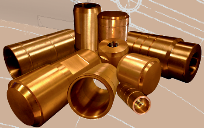
piston according to customer's specification