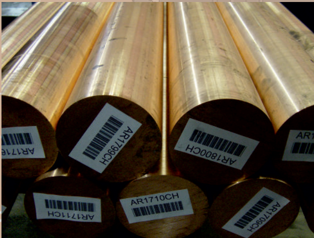
wrought material HOVADUR® CNCS and CCNB