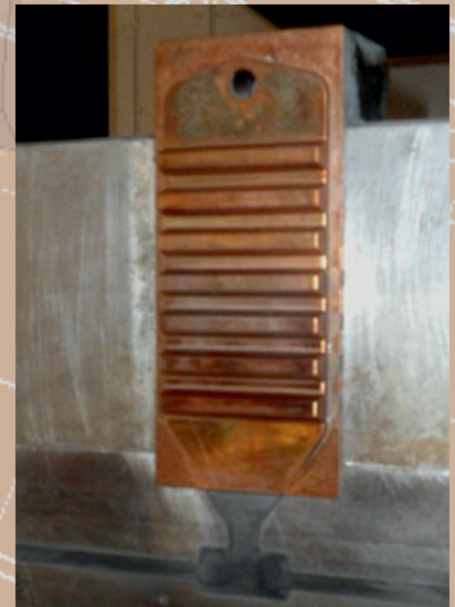
HOVAVENT® vacuum-venting in hard workday life